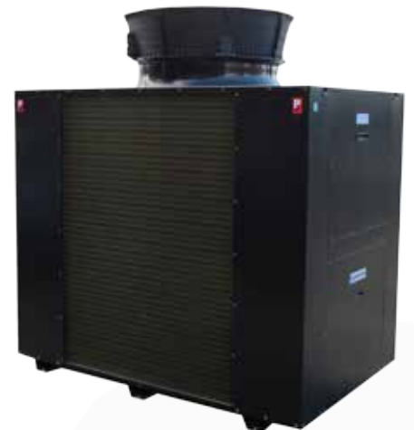
Axitop is optional

Experience the best in heat and chill technology