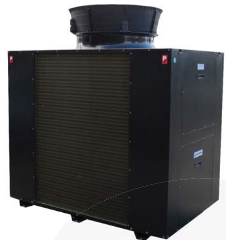
Axitop is optional

All of our heat pump pool and spa heaters are fitted with proprietary titanium tube heat exchangers, with the titanium tubes providing superior resistance against corrosion. Due to its high energy efficiency, the Titanium Series 7GP65-3 Swimming Pool & Spa Heater has an extremely low cost of operation. Typically, for every 1kW of electric input, you receive 5kW worth of heat.