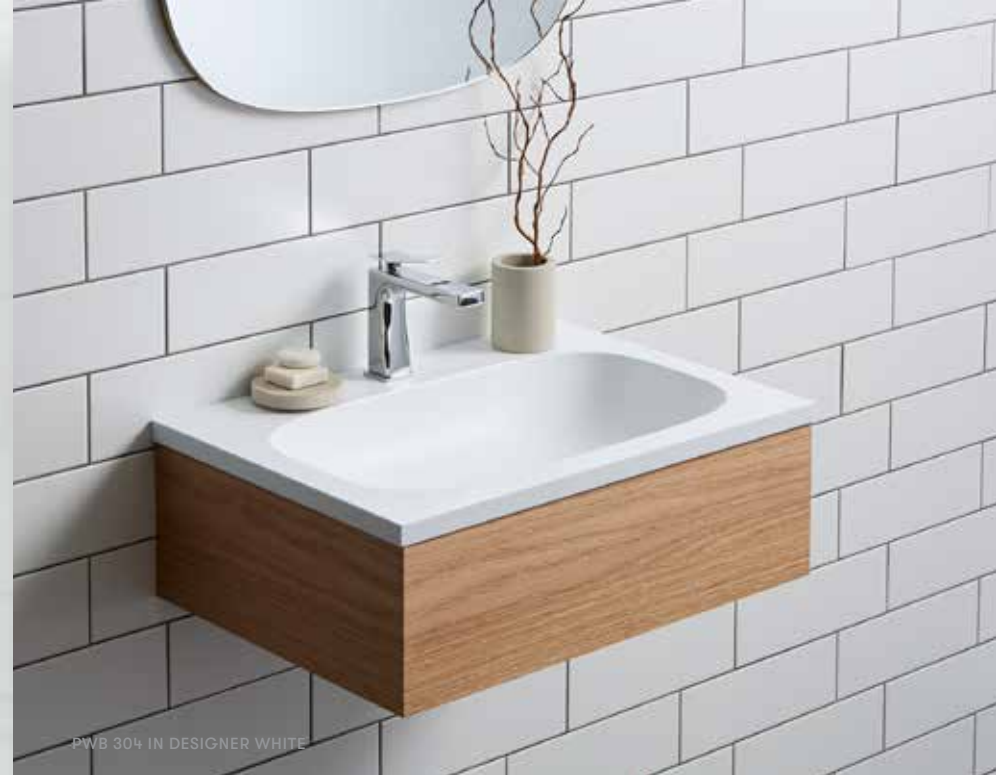
PWB 304 IN DESIGNER WHITE