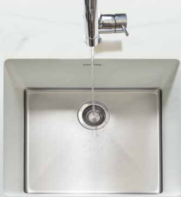
EOS 024 IN VALENTE GRIGIO