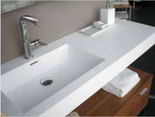
PURE CORIAN® 4530/8110 IN GLACIER WHITE