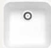
PURE CORIAN® 804