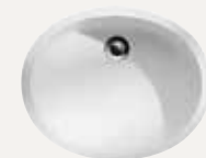
PURE CORIAN® 810

Please visit corian.co.nz for the full range of sinks and basins.