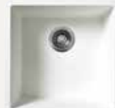
PURE CORIAN® 965