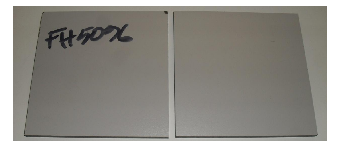
Figure 3 Representative specimen (back face on left, exposed on right)

A variation identified by the client as 6 mm thick Resco Anti-Bac Compact Laminate comprising a phenolic resin core with a melamine resin surface, was prepared as described in Section 2 and subjected to a single indicative tests in accordance with the test standard. Representative specimens are illustrated in Figure 3.