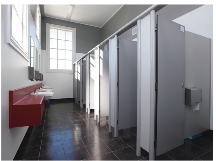
The Grandstand Pavilion