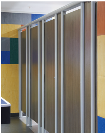
Bar 101 Auckland