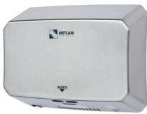
HAND DRYER ECOMO, ECOSLENDER, ECOFAST, ECLIPSE, ML73nI