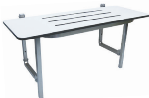
COMPACT LAMINATE FOLDING SHOWER SEAT ML995CL