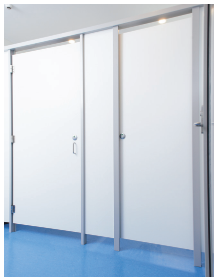
Hamilton Boys High