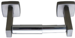
TOILET ROLL HOLDER ML255/256, ML820/825, ML267, ML835, ML837/838, ML4135/4135-2