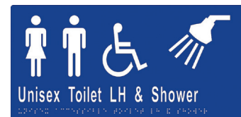
SIGN ACCESSIBLE WC ML16297 SS or LV06/12 (LH), ML16298 SS or LV06/12 (RH)

Series 5000 Series 7000 MultiCom ® MultiCube ®