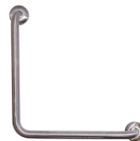
GRAB RAIL MLR112. MLR112 ONLY (pair are required)