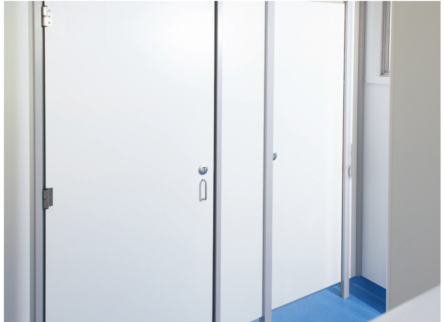
Hamilton Boys High