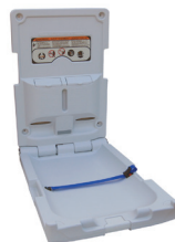
BABY CHANGE TABLE ML9100EVI/EH, ML8200 REC OR SM