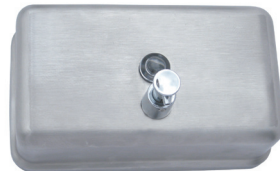
SOAP DISPENSER ML600AS/BS, ML603AS/BS, ML605AS/BS, ML681F/SSF, ML950DA/SS