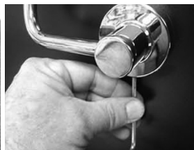
Tighten or remove using Allen Key