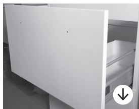
Drawer removal: Push hard on drawer bottom to release the drawer