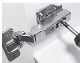
Turn to adjust the door in and out