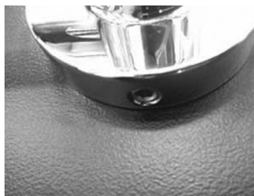
Grub screw at base