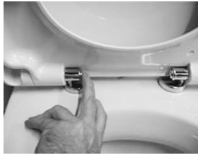
Press left button