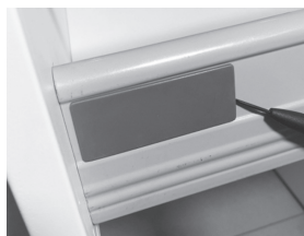
Remove cover plate

Before any drawer adjustment is done please make sure that the cabinet is level by adjusting the feet. Only once the cabinet is level should you then do further adjustment on the drawers. You can adjust the drawers using a screw driver.