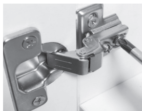
Turn the screw to adjust door in and out