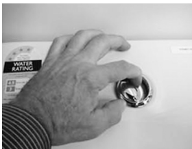
Push one button down