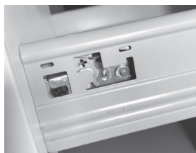
After cover plate removed