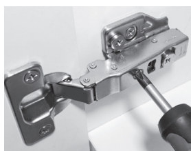
Turn to adjust the door left and right