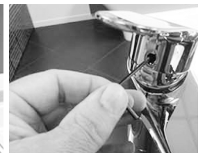
Use Allen Key to tighten or undo