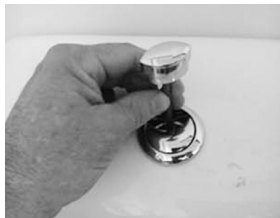
Pull out other button