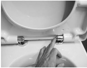
Press right button