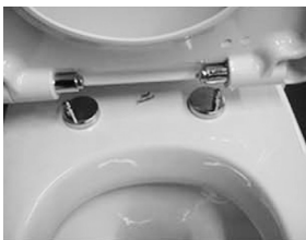
Detach (as shown in toilet seat removal above)