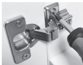
Turn the screw to adjust door up and down