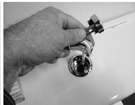
Pull out second button