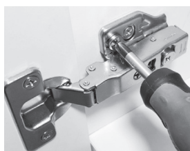
Turn to adjust the door up and down