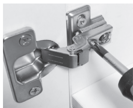
Turn to adjust the door left and right