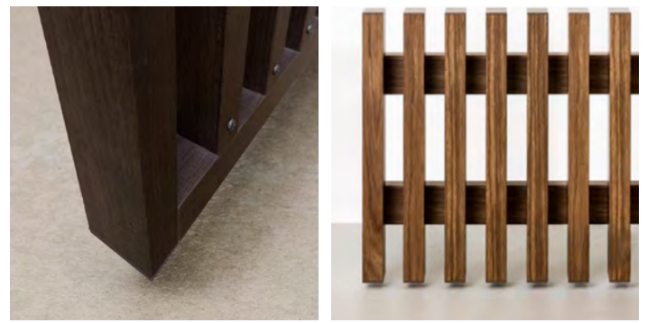
Koshi Screen Cladding - Prefabricated Framed Screens

Prefabricated screens are economic and efficient, taking a fraction of the time to install. Screens are available in a window framed or non-window framed