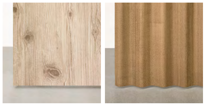
Ever Art Wood® Mokuzai 1mm-2.2mm thick flat panel

Innovative, fire tested panels in a variety of sizes and profiles for rapid installation. Ever Art Wood® panel cladding is ideal for both interior and exterior applications when a low maintenance, real timber aesthetic is required.