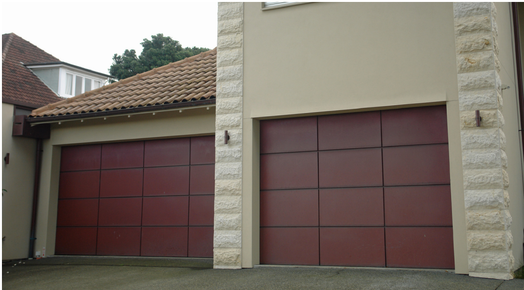
garage door with vertical and horizontal negative joint - copper