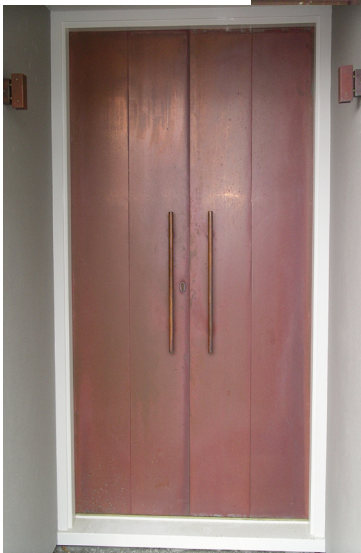
feature door - copper