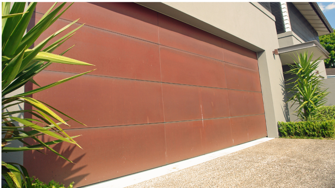
garage door with horizontal joints - copper