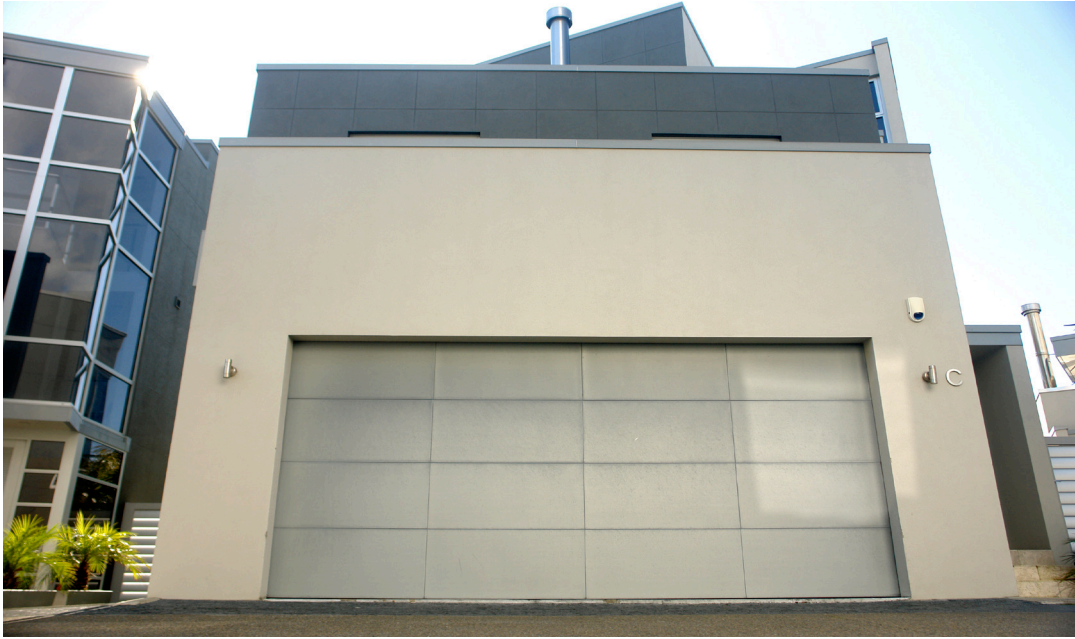
garage door - Quartz zinc