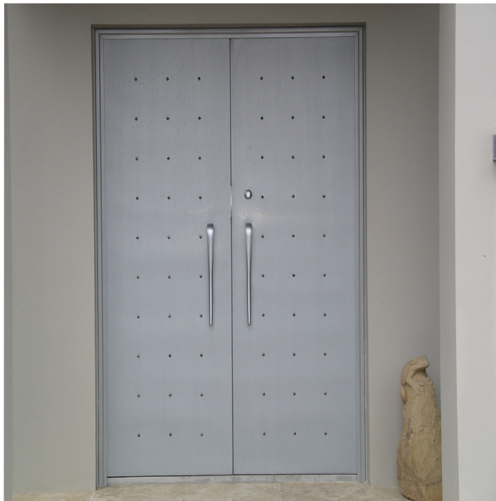
feature door with stud detail - Quartz zinc