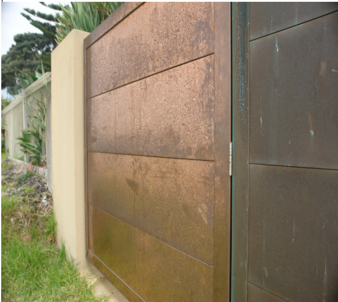
garden gate with a flatlock hook seam in copper