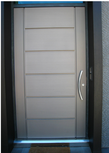
feature door in Quartz zinc