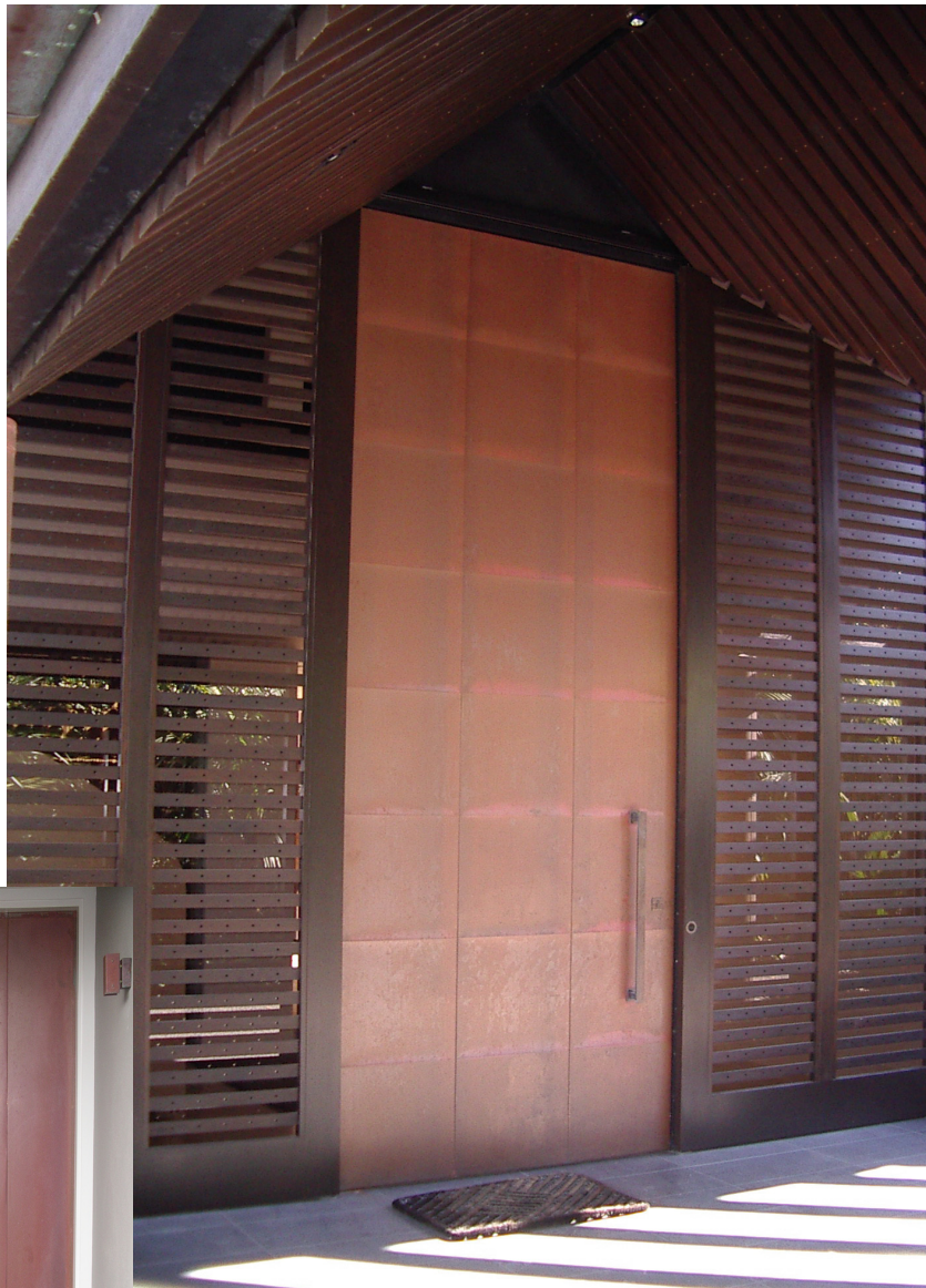
feature door - copper