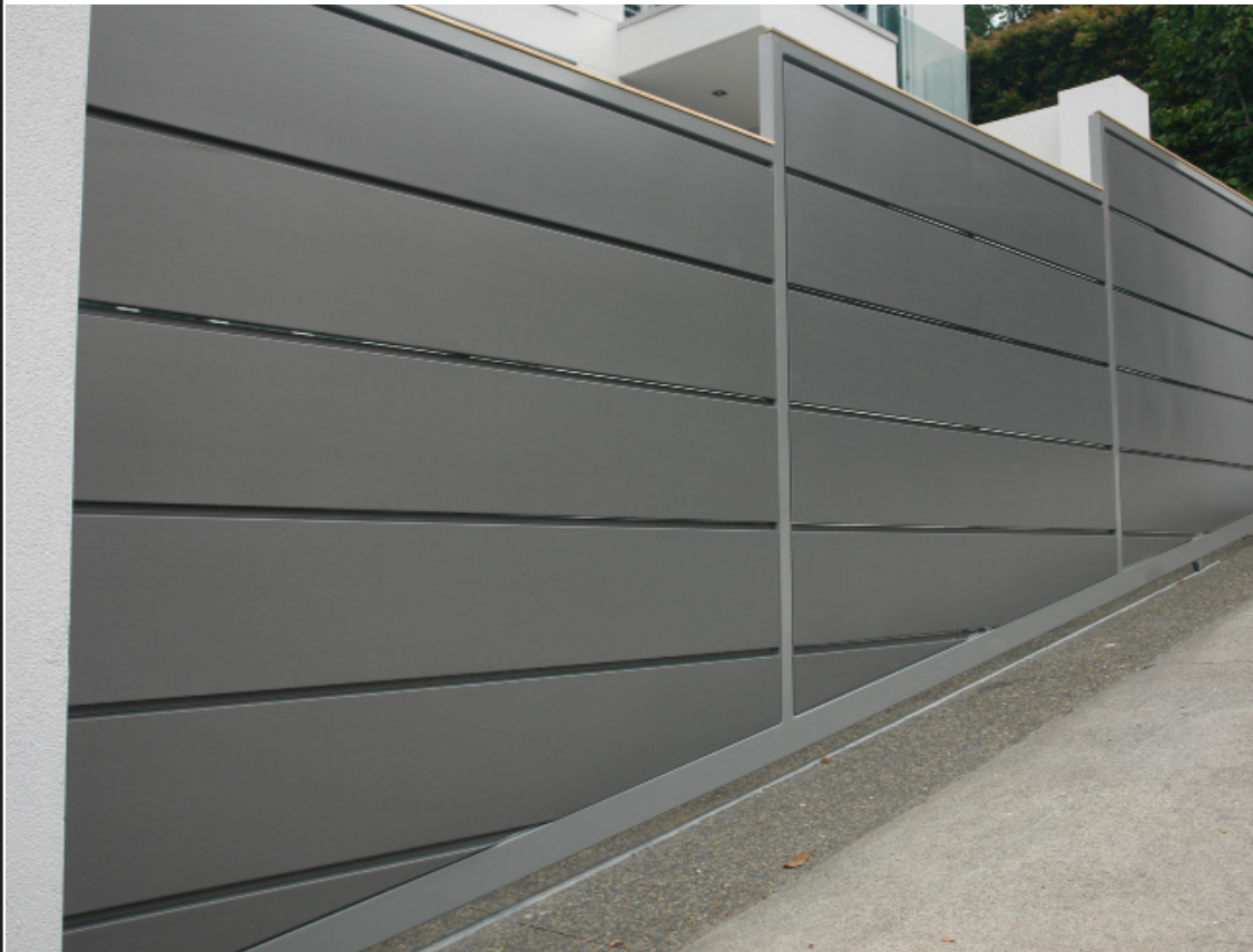
garden gate with a negative seam - Zinc