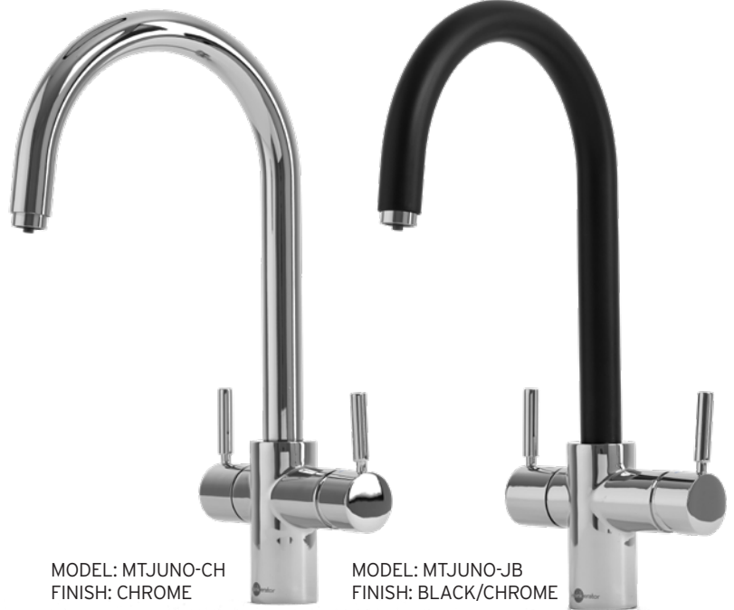
MODEL: MTJUNO-CH FINISH: CHROME