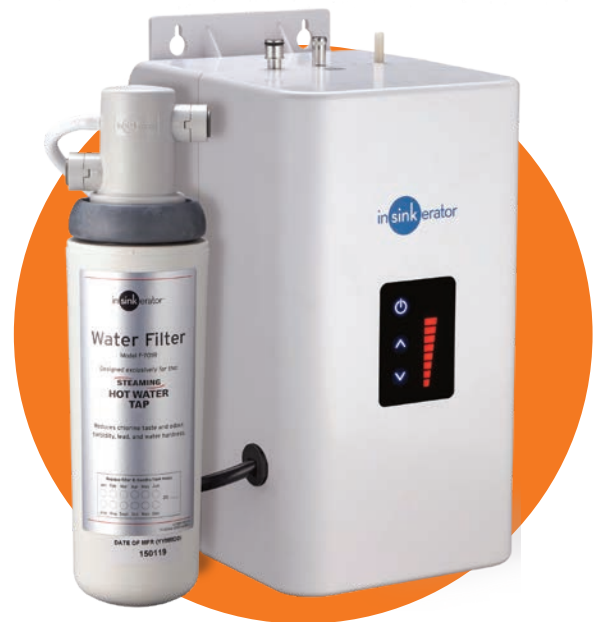
Easy to install under sink tank & water filter