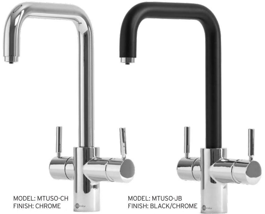
MODEL: MTUSO-CH FINISH: CHROME