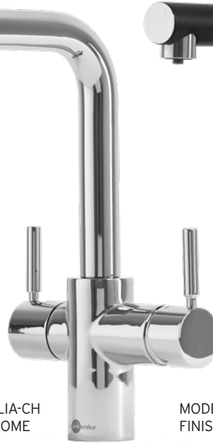
MODEL: MTLIA-CH FINISH: CHROME