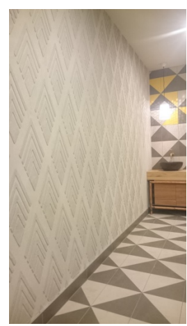
Nandos Restaurant, Auckland City Earthen Clay, with Stencil relief.