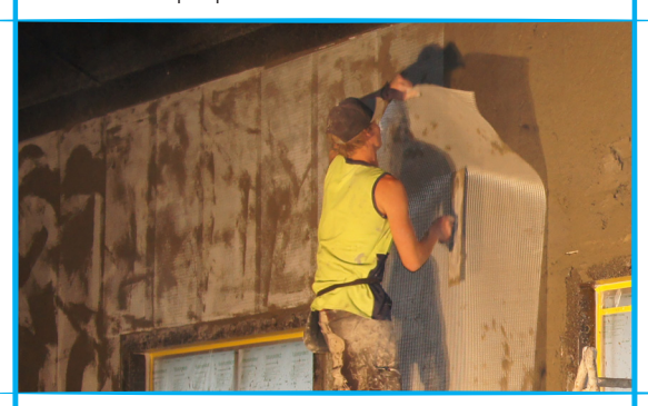
Fibreglass reinforcement application