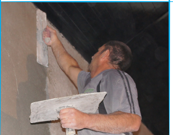
Hand applied smooth finish over Seismolock