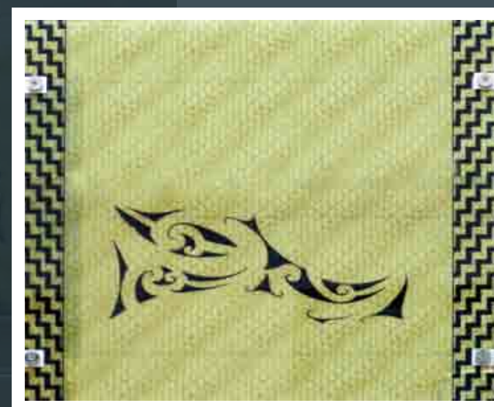
Maori artwork, Internal stairwell - Rotorua Hospital Rotorua

Freestyle by Euroglass™ provides scope for those who see glass as more than just a construction material. We manufacture to the individual requirements and inspirations of our customers. The creative opportunity is limitless and open to a wide range of applications... allow your imagination no boundaries!