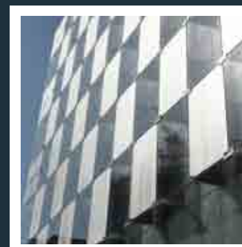
Aluminium mesh external glazing - House of Fashion Spain

25-70%, providing a choice of light transmission. Each of these weaves can be coated with five different metals including Aluminium, Copper, Aluminium/Copper, Chromium, Titanium and Gold.