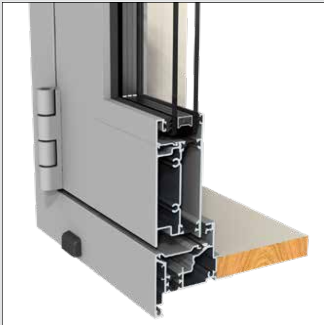
Hinged door frame - open-out (drainage cap shown).