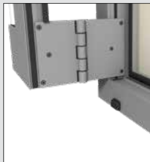
Parliament hinge in open position.