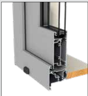
Hinged door frame - open-in.