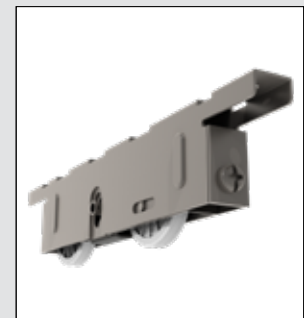
The sliding window roller is rated to 80kg so windows of 160kg can be carried.