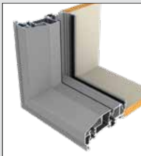
Single slider frame and flush track.