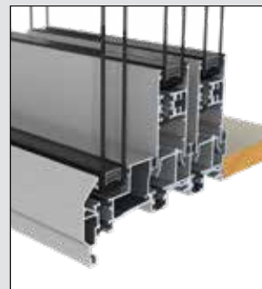
Double slider array with panels and fixed light.