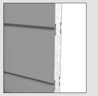
Latitude tongue and groove joints.