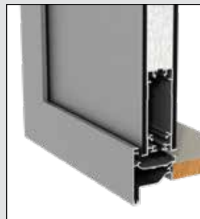
Plasma door and thermally broken rail.