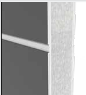
Plasma door negative detail.