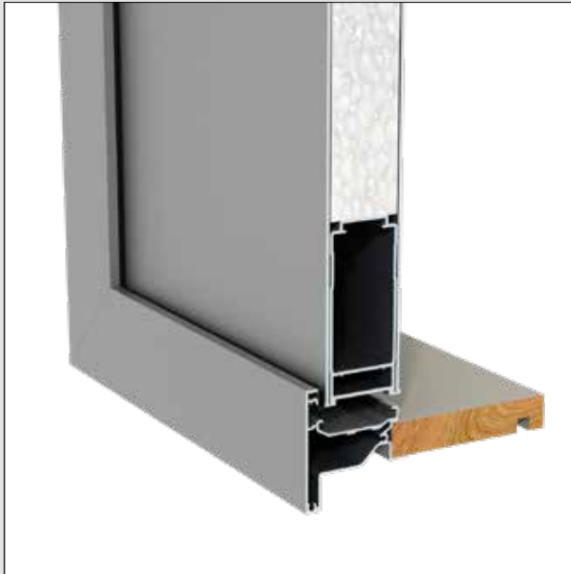
Door frame and Plasma internal bottom rail.