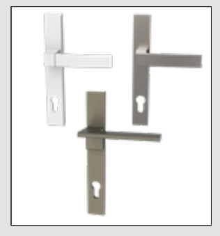
Urbo, Elemental and Icon lever handles.