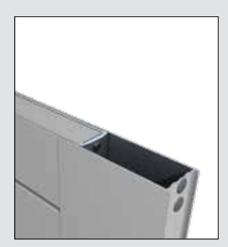
Aquila door with standard stile.