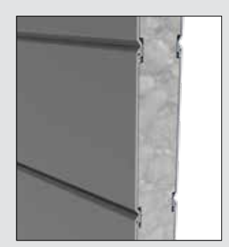
Tongue and groove sectional detail.