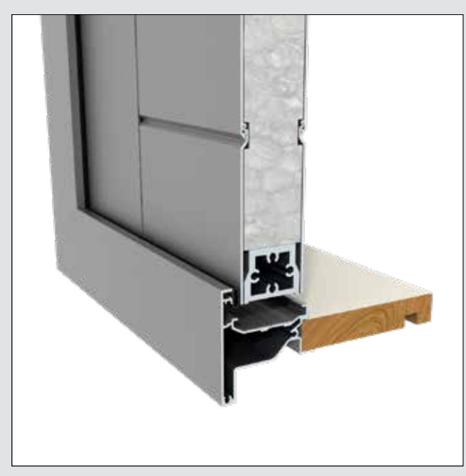
Door frame and Aquila sectional detail.