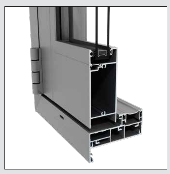
Hinged door frame (106mm) - open-out.