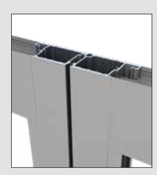
French door meeting stiles.