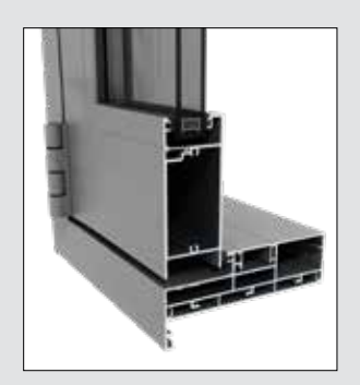
Hinged door frame (158mm) - open-out.