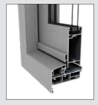
Open-in door with weather bar on door rail.