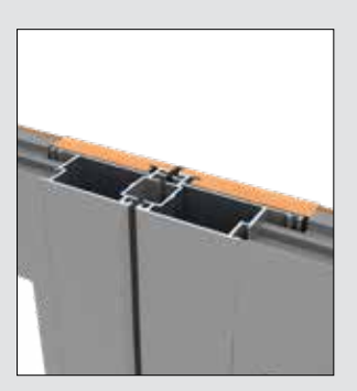
Bi-parting slider meeting stiles.