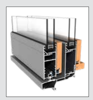
Slider with sightline adaptor at back.