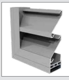
Fixed louvre frame and profile.