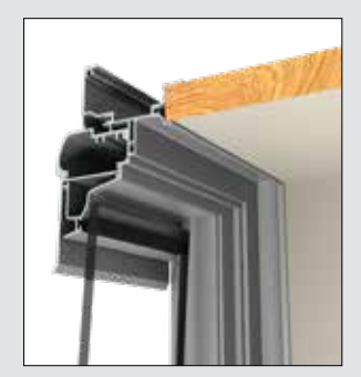
Louvre head section with external weather bar fitted.