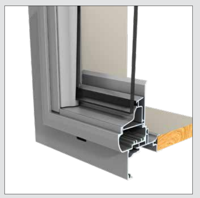
Louvre frame and bottom glass blade (with weather bar).