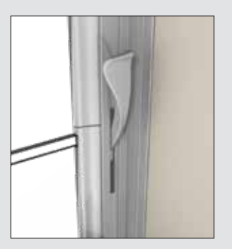
Louvre control lever (nylon grip).