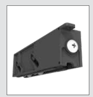
The sliding window roller is rated to 150kg so windows of 300kg can be