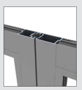
Bi-parting meeting stiles.