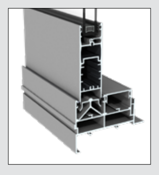
Flush sill option with bottom rail.