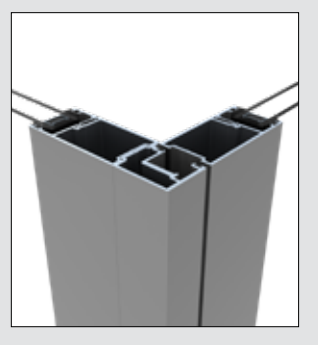
90° corner meeting stiles.