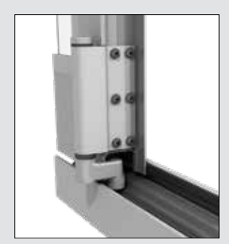
Roller and hinge on bi-fold stile.