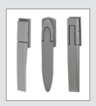
Urbo, Miro and Icon bi-fold handles.