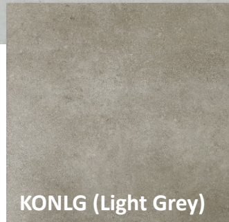
KONLG (Light Grey)