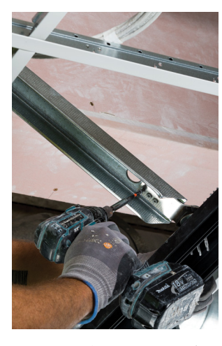
8/ Connect bracing material to TRACKLOK® fly brace with #10-gauge wafer tek screws.