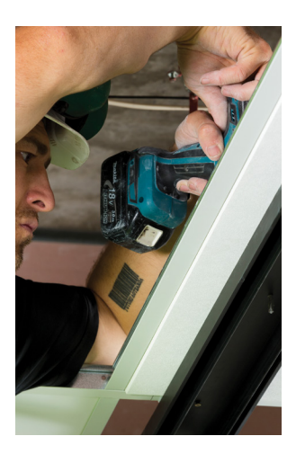
2/ Create 30mm to 40mm clearance hole in ceiling tile with holesaw (pilot bit marks centre point on head track).