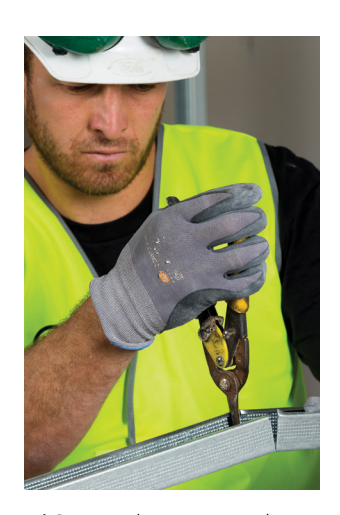
6/ Cut your brace material to length as per chart provided.