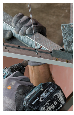
7/ Connect stud to 45° top connectors and 45° GRIDLOK® arms.