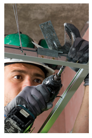
1/ Place GRIDLOK® in position specified on ceiling grid main runner or top cross rail and fix with #10-gauge wafer tek screws.