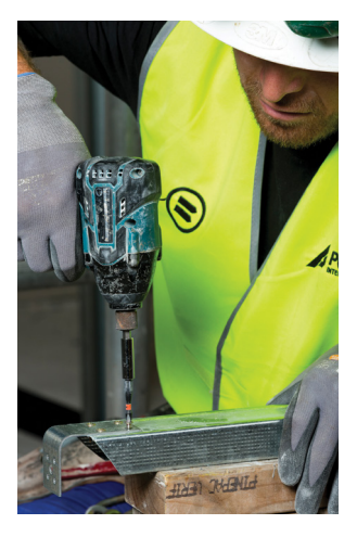
4/ Attach vertical top connector to cut stud.