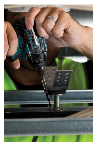
4/ For TRACKLOK® RETRO screw directly into head track.