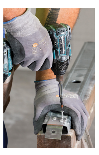
7/ Connect bracing material to TRACKLOK® top connector with #10-gauge wafer tek screws.