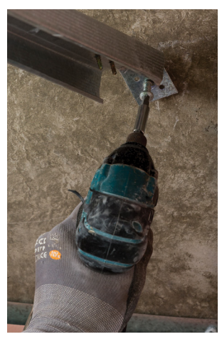
9/ Fix GRIDLOK® top connectors to structure over with approved anchors.