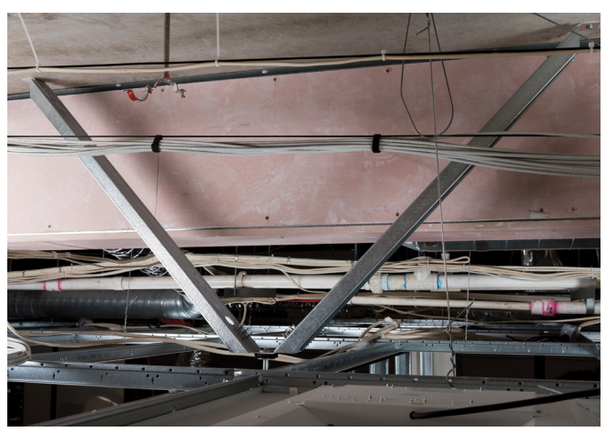
11/ TRACKLOK® install complete.