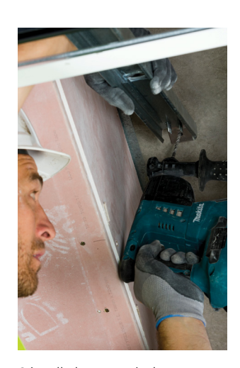
9/ Drill clearance hole into structure over.