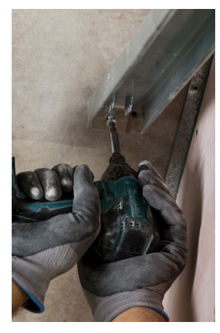
10/ Fix TRACKLOK® top connectors to structure over with approved anchors.