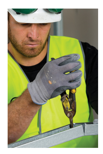
3/ Cut your vertical steel stud to length. Will need to repeat for the two 45° steel studs as per plenum chart provided.