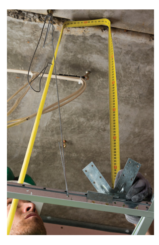
2/ Measure distance to structure from ceiling grid.