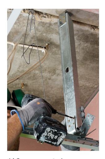
6/ Connect vertical arm to GRIDLOK® unit and rotate to avoid service clashes.