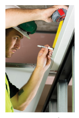
1/ Measure TRACKLOK® placements (refer to TRACKLOK® set out charts).