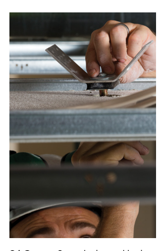
3/ Create 9mm hole and bolt TRACKLOK® firmly to head track using washer and bolt provided.