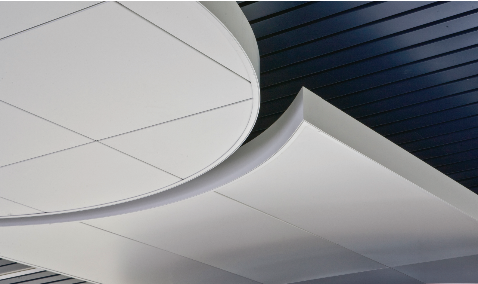
COMPASSO Elite Perimeter Trim with HALCYON CLIMAPLUS Ceiling Panels/ DONN FINELINE DXF Suspension System