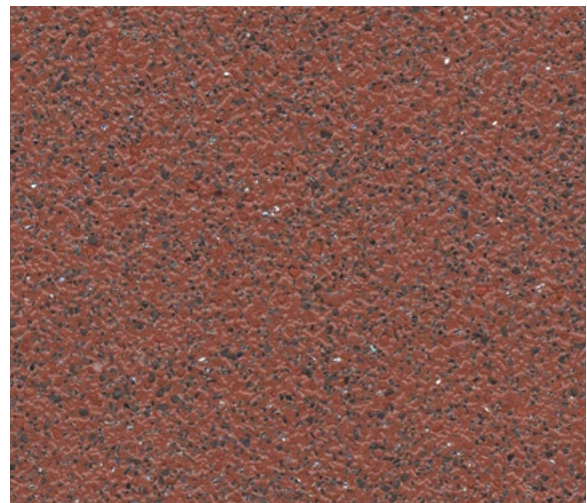
Red Ochre 4206