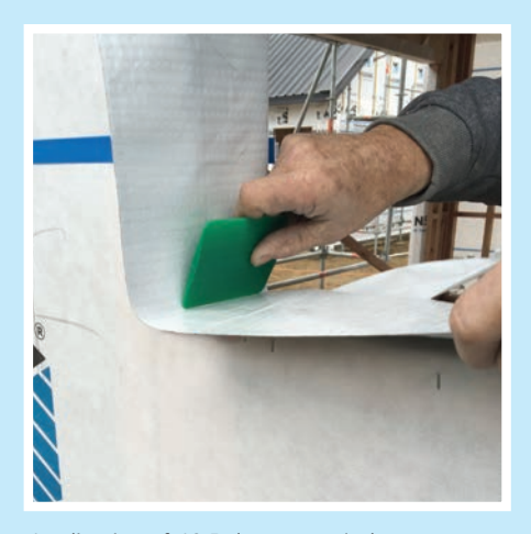
Application of 40 Below on a window

Tested to ASTM D3330 for adhesion and AAMA-711.5.21 for nail and screw sealability.