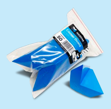
Masons Corner Guards For use with 40 Below Flashing Tape