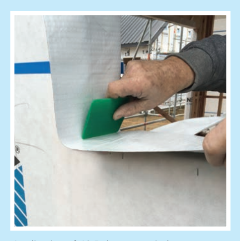
Application of 40 Below on a window

Tested to ASTM D3330 for adhesion and AAMA-711.5.21 for nail and screw sealability.