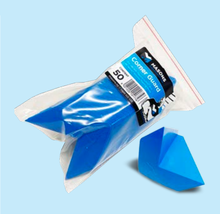
Masons Corner Guards For use with 40 Below Flashing Tape