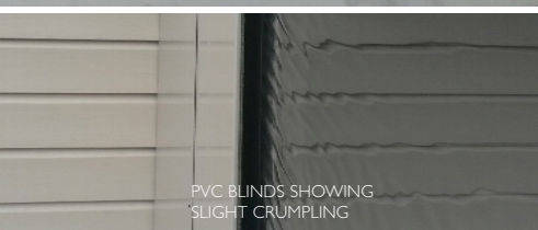
PVC BLINDS SHOWING SLIGHT CRUMPLING

The above are not product defects and are not covered by the warranty.