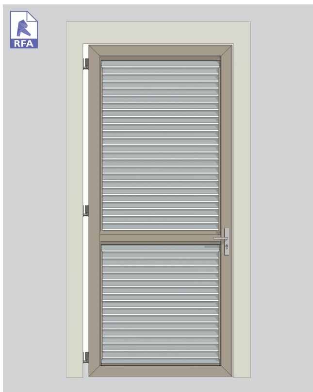
ULTRA WELDED HINGED DOOR WITH TRANSOM