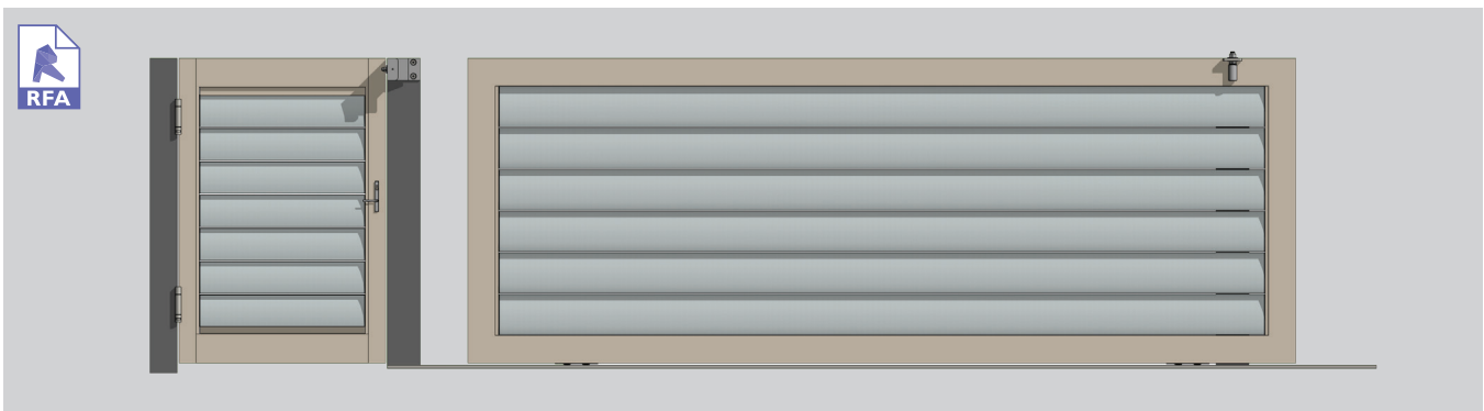
SLIDING VEHICLE GATE WITH HINGED PEDESTRIAN