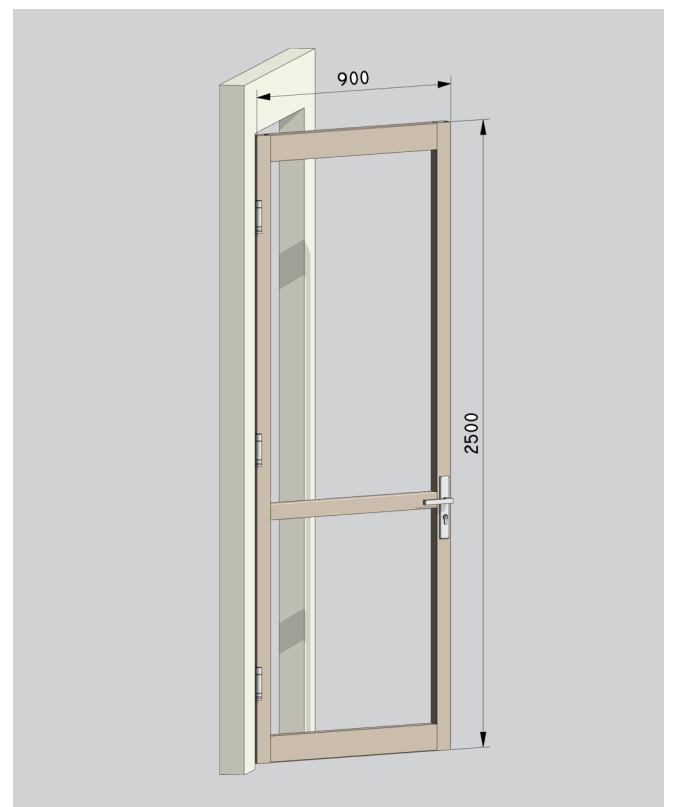
HEAVY DUTY HINGED DOOR RECOMMENDED MAX SIZES