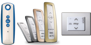
HAND HELD AND WALL MOUNTED REMOTES