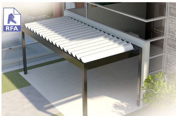
260 TRANSLUCENT OPENING ROOF