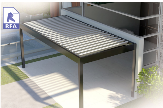
200 SUPER ROOF SERIES - LITE