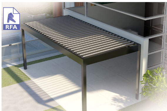
180 LINEAR OPENING ROOF