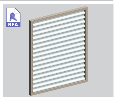
ELAM STREET STRUCTURAL FRAME FRAME - HORIZONTAL SUPER ELAM STREET STRUCTURAL FRAME WITH SUB-FRAME END FIXED - VERTICAL PANEL