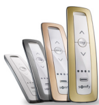
HAND HELD AND WALL MOUNTED REMOTES