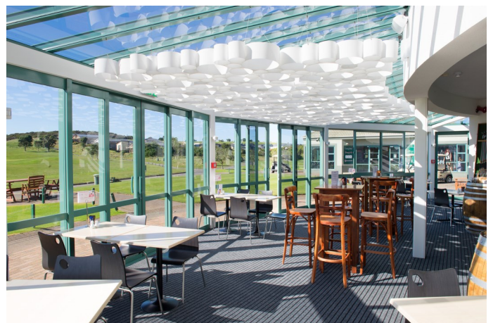
Gulf Harbour Country Club, conservatory