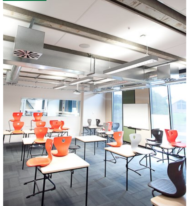
Goodman Feilder—Training Room