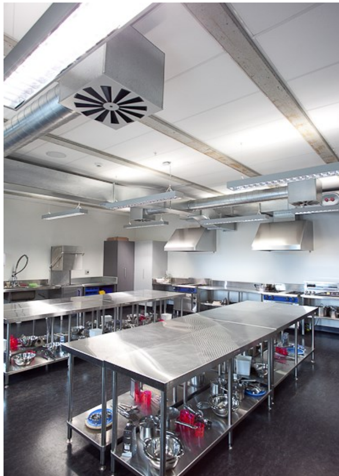
Albany High School—Food Tech Classroom