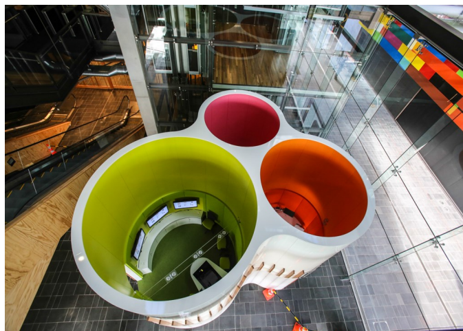
ASB North Wharf—Media Silo