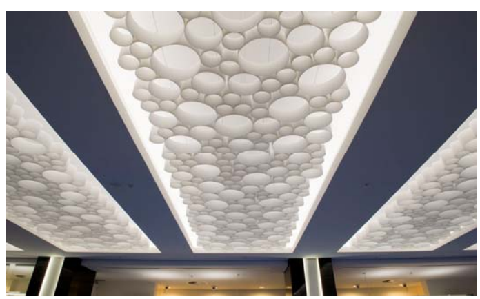
AO-Gami formed from white Sonatex.