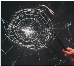
Forced Entry/Smash and Grab

3M™ Impact Protection Adhesive improves the overall performance of 3M™ Safety and Security Window Films. This unique window protection system combines the toughness of 3M's patented micro-layer safety film with 3M's world-class expertise in adhesives to help shield against impact energy from severe weather, earthquakes, bomb blasts or forced entry events. The 3M Impact Protection System also helps protect against personal injury from flying glass.