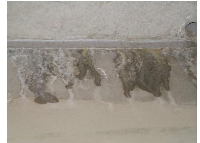
Efflorescence on concrete floor

Efflorescence appears as a white deposit of mineral salts on face of concrete walls and/or floors. Efflorescence usually appears in underground car park areas and other subfloor areas. Efflorescence is caused by moisture ingress. As the moisture enters and moves through the wall or floor, it dissolves mineral salts present in the cement. This mineral salt solution eventually finds its way to the surface of the concrete. As the water evaporates, it leaves behind a white deposit of mineral salts on the surface.