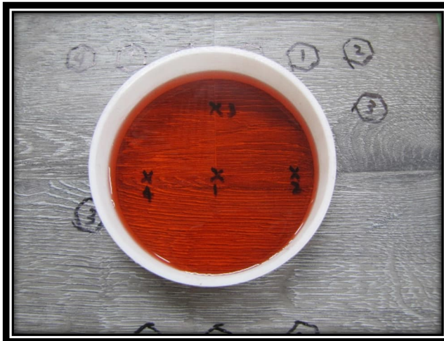
24 Hrs with Water