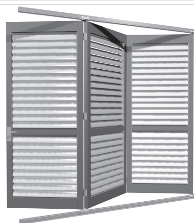
THREE PANEL BIFOLD DOORS