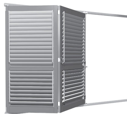
TWO PANEL BIFOLD DOORS

// The same options of two pivot systems - namely Kiss Pivot and P40 Pivot, as well as simply end fixed available in the sliding shutters are also available in the bi-fold shutters.